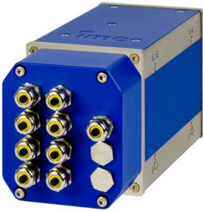
imc CRONOScompact-02-BR2-4-IP65 shown with protective terminal caps

Beyond this, the measurement devices provide decisive flexibility: any device already configured can be quickly transplanted - ensuring swift transition between field and lab settings.