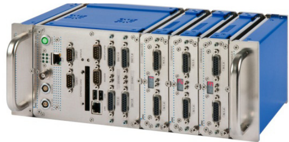
Flexible, expandable, fast: imc CRONOSflex

Whether it's analog measurement on a few channels, or complete technical approval testing for a high-speed train on over 1,500 channels - in every case, the issues of measurement effectiveness and quality of results are crucial.