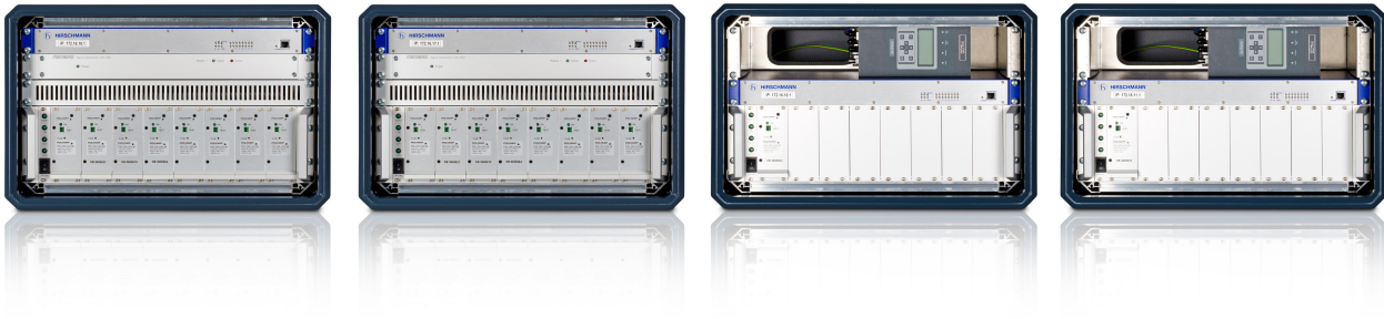
Infrastructure components: Measurement Control Unit (MCU) and Time Control Unit (TCU)