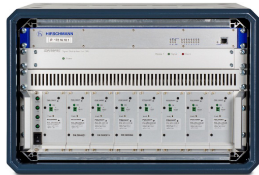
Infrastructure component: Measurement Control Unit (MCU)

Large, spread-out system configurations are especially easily achieved by means of imc measurement equipment. For the role of system components, the individual devices are equipped with standard Ethernet terminals, universal wide-range DC power supply (10 ... 50V DC), and precise synchronization mechanisms.